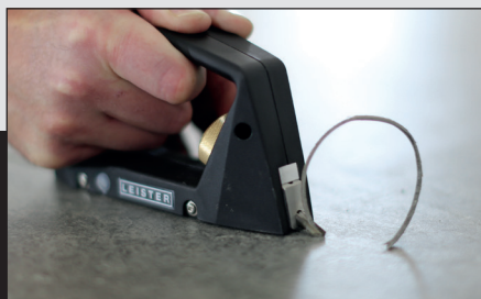
Precise and simple guidance thanks to integrated guide rollers