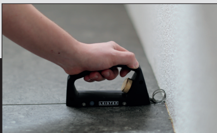
Executing clean grooves up to connecting walls

151.394 Protective plug 150.815 Blade 3.5 mm (0.14 inch) 154.717 Blade 2.5 mm (0.1 inch)