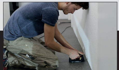
Ideal for surfaces that are small and difficult of access

Headquarters: Leister Technologies AG 6056 Kägiswil / Switzerland leister@leister.com